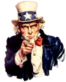
"We love ham radio."