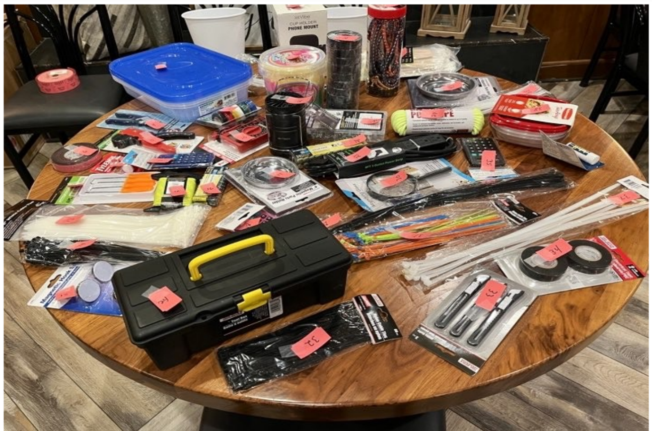
Table of Goodies — everyone came away with two randomly drawn prizes.