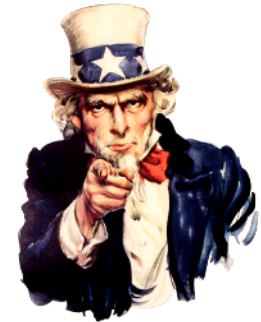
"I love ham radio."