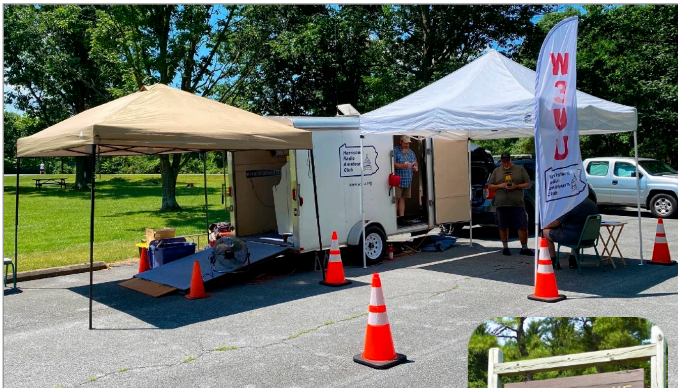
W3UU at Memorial Lake State Park, Lebanon County, PA.

"The purpose remains today as it did in the beginning: to demonstrate the communications ability of the amateur radio community in simulated emergency situations."