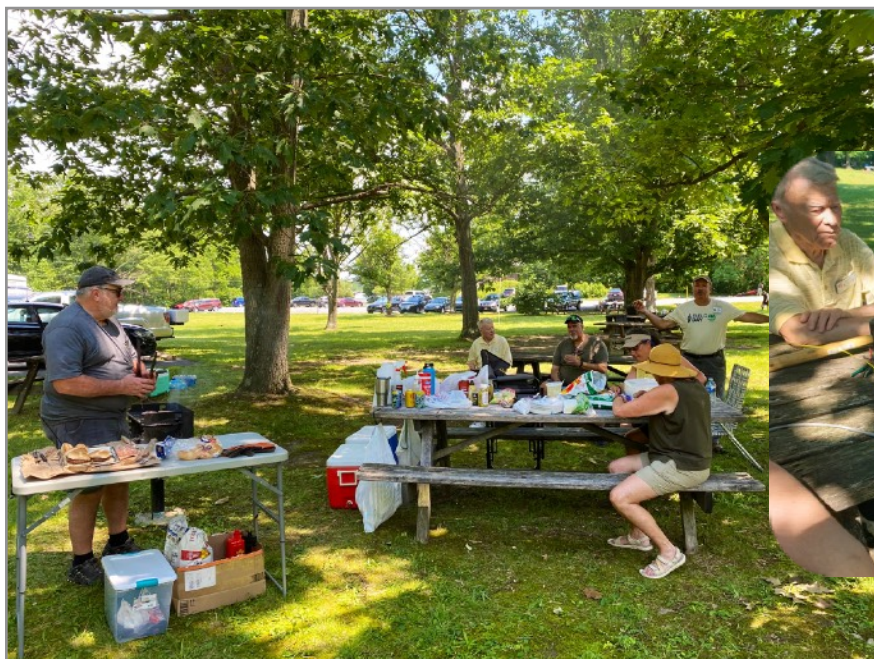
The shade and good food came in handy!