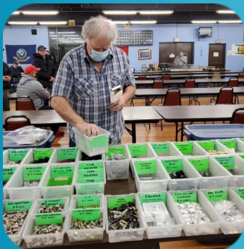
A vendor prepares his wares.