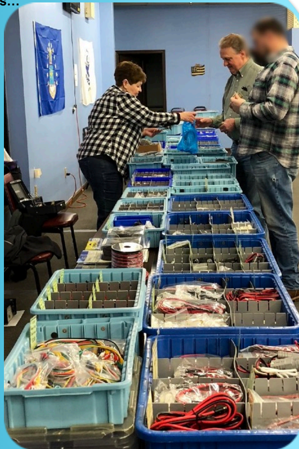
Satisfied customers at Sauder Electronics.