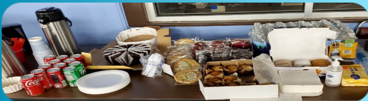
Refreshment exceeded expectations. Homemade muffins by KZ3KBD. — KC3MG