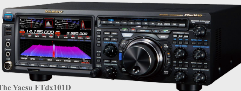
The Yaesu FTdx101D

1 Visit www.sherweng.com/table.html for details. The top 25 is not an endorsement by HRAC or the author — a solely extracted editorial by K3URT.