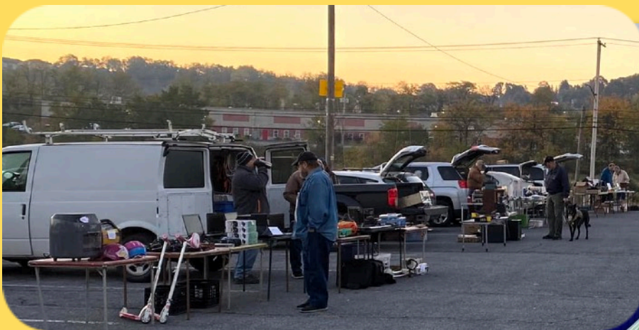
Two of the concession volunteers of the Vietnam Veterans Local 542 , Harrisburg.