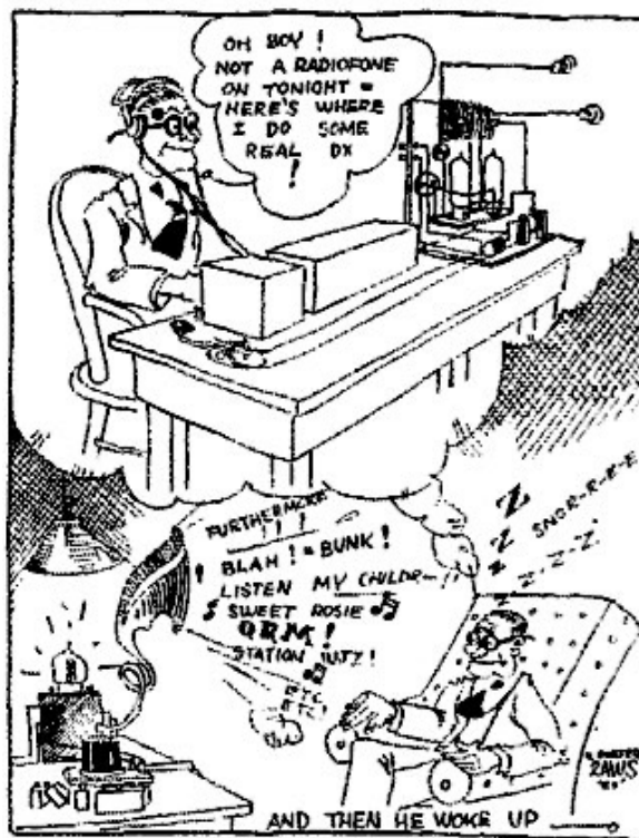
QST, September, 1922, p. 37.