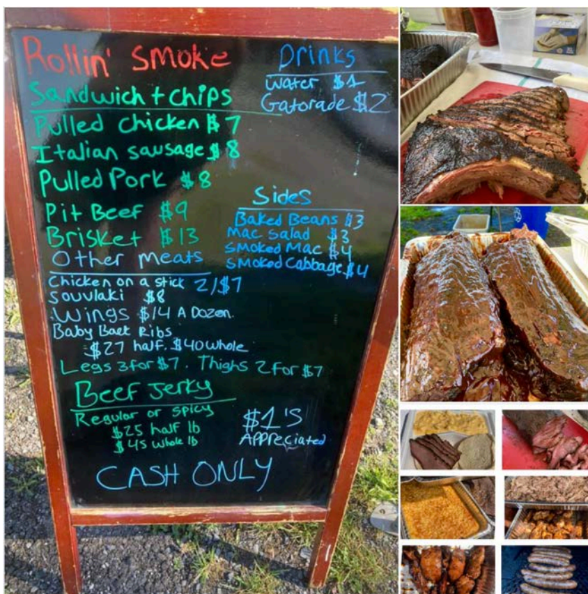
Rollin' Smoke Mobile BBQ & Catering serving at 0630L. (prices and menu subject to change).