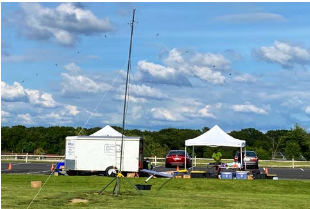
W3UU Field Day site.