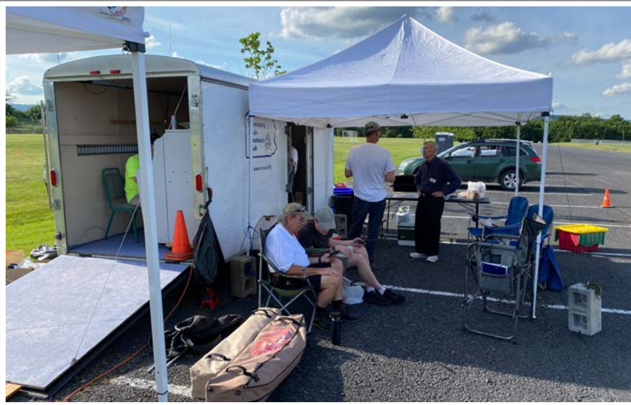
Another Field Day is in the history books. More photos page 8.

HRAC meets the second Wednesday of the each month with “Ham 101” education at 1830L, business meeting, 1900L at the Harrisburg Vietnam Veterans of America Chapter 542 , 8000 Derry St., Harrisburg, PA 17111.