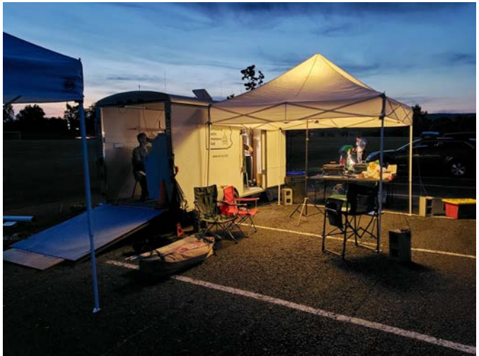
W3UU set up and operating into the night at Adams-Ricci Community Park, Enola.