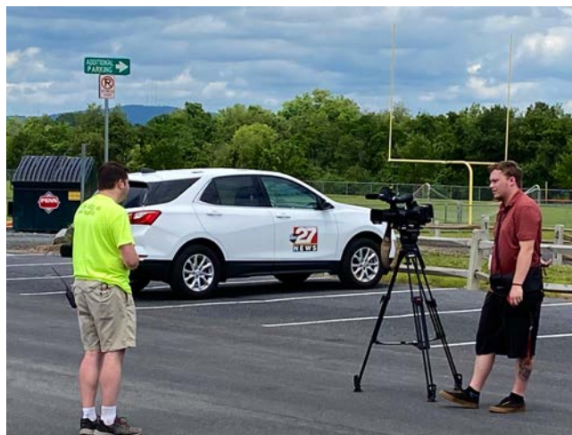
WHTM-TV visited the site. A full story may be viewed at: https://tinyurl.com/cs7cz2tc

More images can be found on the Club's Face Book page.